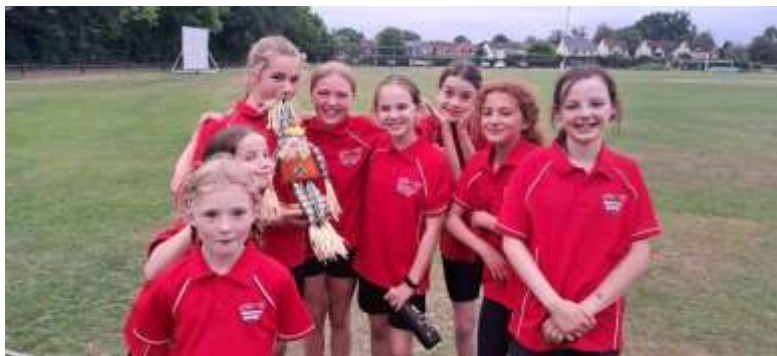
Purley on Thames Girl's Cricket Team

Follow this link to see forthcoming cricket fixtures.